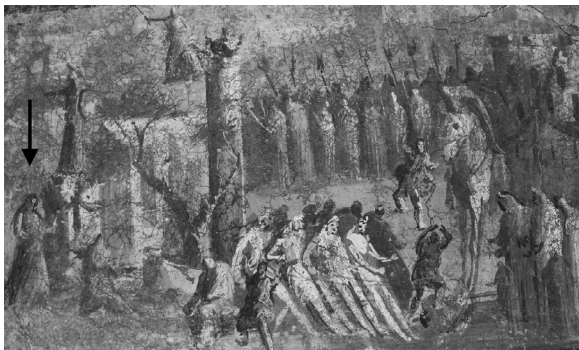
Figure 9.2 Trojan Horse, Pompeii, House of Cippius Pamphilus (VII.6.38), Museo Archeologico Nazionale di Napoli, inv. 9010.

picked a motif that was popular with theatrical audiences. We admittedly do not have any direct attestations for performances of the Alexander in the 50s BC, but we do know from a letter of Cicero's ( Fam. 7.7) that a luxurious revival of an Equus Troianus tragedy was put on at the spectacular inauguration of the Theater of Pompey in 55 BC. The show was a great success with the people ( Fam. 7.7.2), though the orator himself disapproved, and it occurred only briefly before the aforementioned staging of the Andromacha in 54 BC. In alluding to the Alexander's narration of the fall of Troy and the Trojan Horse, Lucretius is thus gesturing toward a moment that his readers would have experienced in one form or another at the late Republic's increasingly sensational ludi scaenici , perhaps even on multiple occasions.