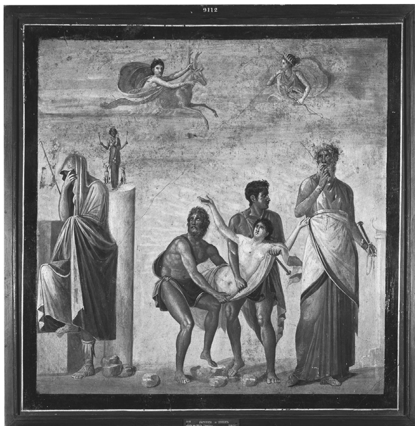
Figure 9.1 Sacrifice of Iphigenia , Pompeii, House of the Tragic Poet (VI.8.3), Museo Archeologico Nazionale di Napoli, inv. 9112.

have influenced a painter, even if he was also imitating Timanthes. Cicero, for one, hints at such mutual cross-pollinations at Orat. 74, where he notes that in portraying the sacrifice of Iphigenia ( immolanda Iphigenia ), a painter ( pictor ille ) will portray varied characters in different gradations of sadness, culminating in Agamemnon with his head veiled ( obvolvendum caput Agamemnonis esse ) as in the Pompeian fresco, and that similar observations apply to an “actor” ( histrion ).